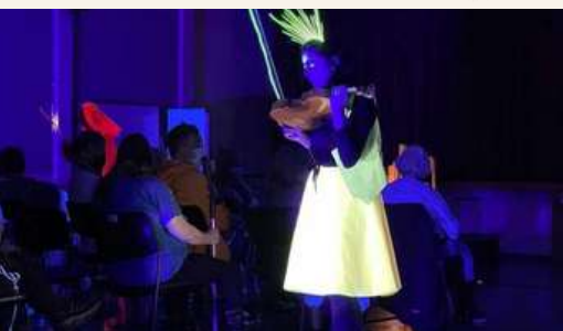
"The Dream Makers" Show performed for psychiatric patients in Liege - October 2021

The project "Harmonies of Dreams" offers the beneficial qualities of classical music to hospitals and homes. Several original shows created by the Akhtamar Quartet have been adapted for every patients. Each performance consists of a tailored musical journey, supported by healthcare professionals. Created thank to the support of "Un Futur pour la Culture", this project began in Liege and Brussels for more than 250 people, and is expanding throughout Belgium.