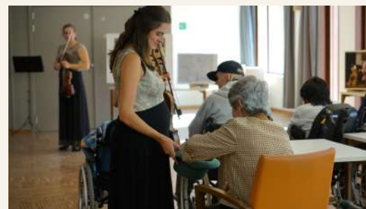
Concert in support of healthcare professionals during the covid-19 pandemic in Liege - July 2021

Human beings are receptive to music throughout their lives. Both a universal language and a source of well-being, music is used increasingly in the medical world. Its benefits are most renowned in psychiatric care and the monitoring of patients, as it has a clear impact on motor functions and memory. Convinced by these potential benefits, the Akhtamar quartet formed a mission to make their music sound in hospitals and medical institutions. Through their live performances, they would share the qualities of journeys and dreams with those patients who no longer have the opportunity or ability to experience them. This project is based on principles of music therapy.