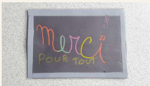
Souvenir given by the teenagers of the hospital ISoSL in Liège - October 2021